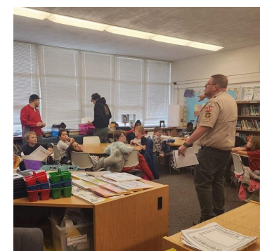
MI Crossroads Council - BSA

The Albion Community Foundation has completed two of their three 2024 grant rounds, impacting a number of community organizations. Over the two rounds, the Foundation has awarded over $70,000!