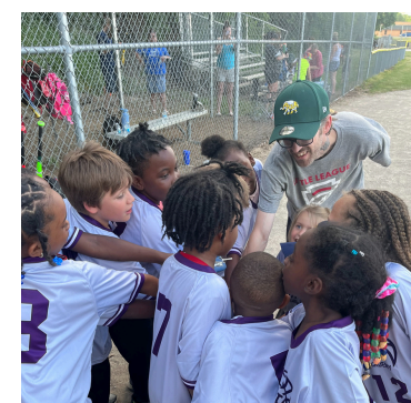
Play Right Sports Academy