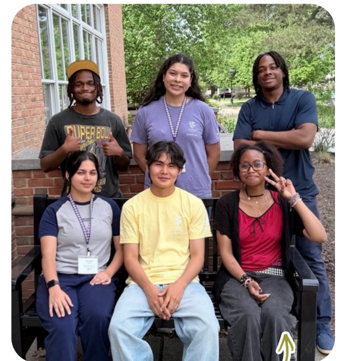
The summer team!

We are so grateful for the continued love and support from this community. Thank you for growing alongside us as we work to make Tech Savvy Seniors even stronger. We look forward to continuing to serve you as best we can, this summer and beyond!