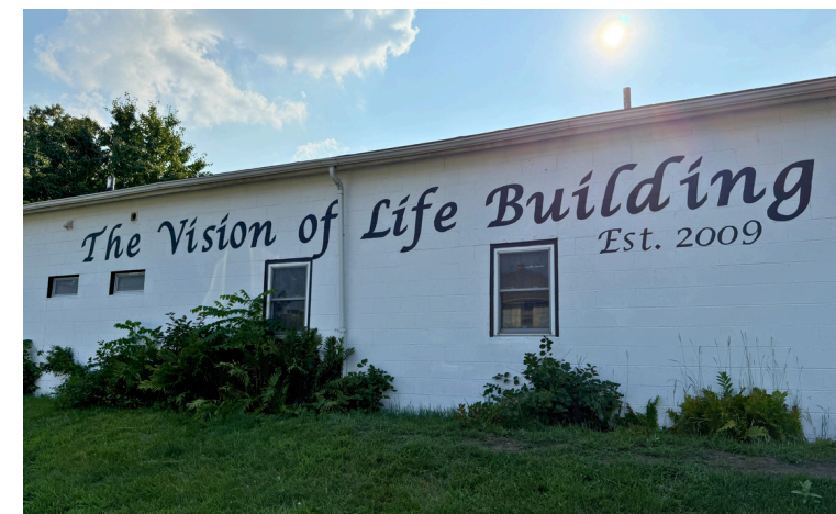
The Vision of Life Building located at 718 Austin Ave, Albion, MI