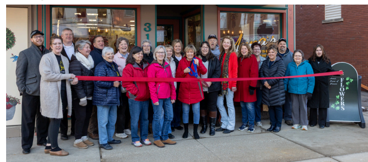
Anna's House of Flowers 40th anniversary ribbon cutting.