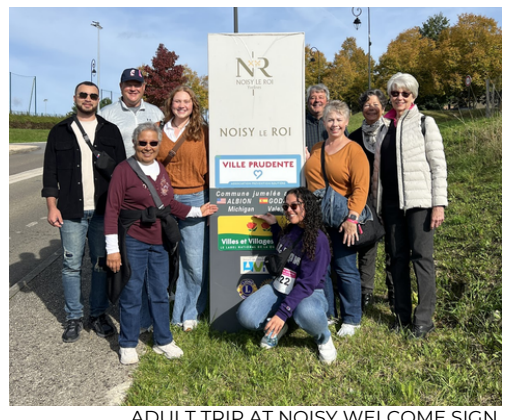
ADULT TRIP AT NOISY WELCOME SIGN

The group of travelers spent their trip exploring the communities of Noisy-le-Roi and Bailly, venturing into the big city of Paris, diving into history in Versailles, and making countless memories in-between.