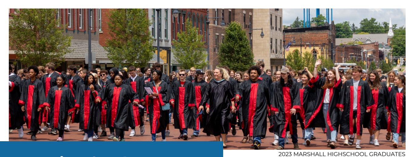
Planning for the Future