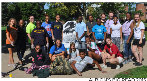
ALBION'S BIG READ 2015

For the past ten summers, Albion's Big Read has brought together 8th through 10th graders, the Big Read Leaders, to laugh, read, discuss, and share with one another. Then throughout the month of October, the Leaders bring the Albion community together through book discussions on the common reading.