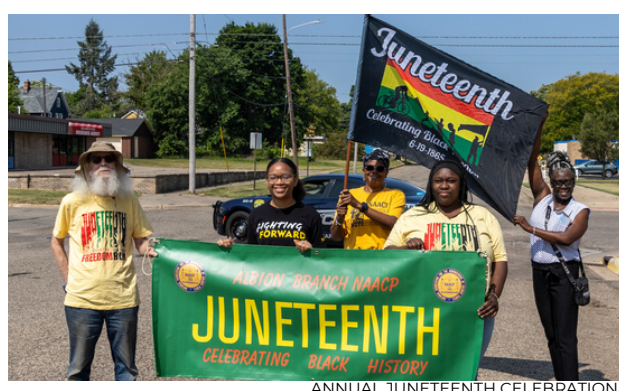
ANNUAL JUNETEENTH CELEBRATIO

DOWNTOWNAL BION.COM GREATERALBIONCHAMBER.ORG