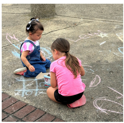
YOUTH AT YAC'S FARMER'S MARKET BOOTH

Supporting Economic Development is critical to creating a prosperous and vibrant community. The Foundation will be working with local businesses, government, and residents to foster job creation, entrepreneurship, and community revitalization.