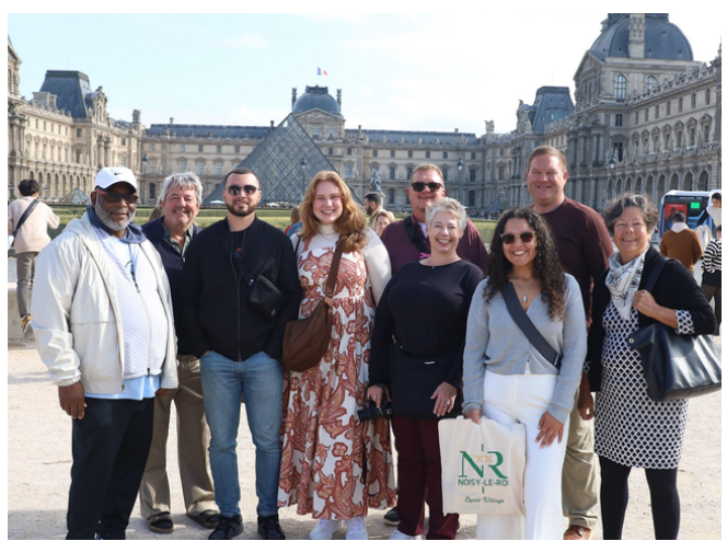
ADULT TRIP OUTSIDE THE LOUVRE MUSEUM.

In late June, eight youth and four adults set off to France for a two-week trip, and in mid-October eleven adults. During each trip, travelers stayed with host families in our sister cities, creating a unique and special experience.