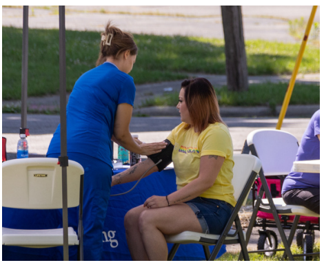
HEALTH CHECKS DURING JUNETEENTH

Education is the foundation of a thriving community. The Foundation will be working to ensure that all of Albion's children have access to quality educational opportunities, from early childhood through post-secondary education.