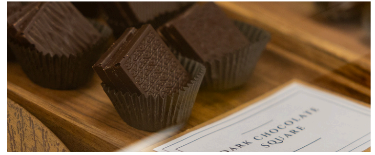
Chocolates from Yellow Bird Chocolate Shop.

Other screenings include February 4th When Harry Met Sally , February 18th In the Good Old Summer , and February 25th Casablanca .